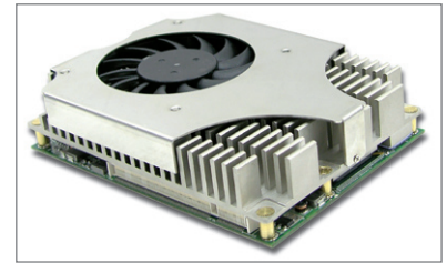
Active Heat Sink